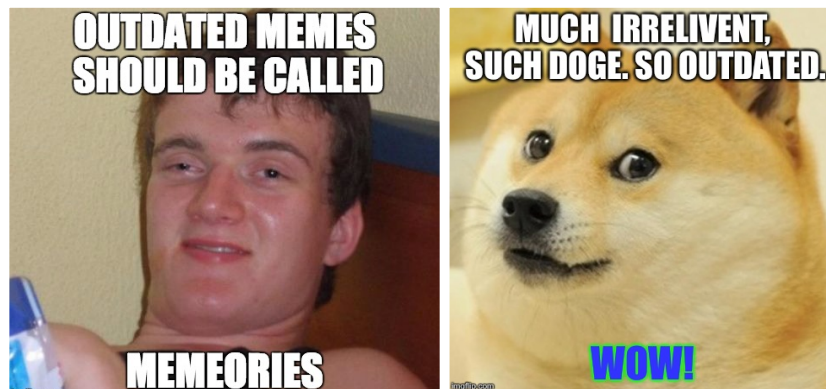
Fig. 1-2: Internet memes referring to their outdated state

It does not necessarily mean that we are unable to appreciate online visual or audiovisual content, but the speed at which we move through it is much faster than before, changing our experience of temporal linearity and conventions of time. 22