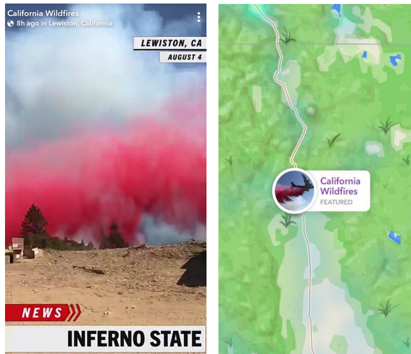
Fig. 7–8: Screenshots of a news event on the Snap Map

by the app and text is added to create the feeling of an unmediated news story (see Fig. 7 and 8).